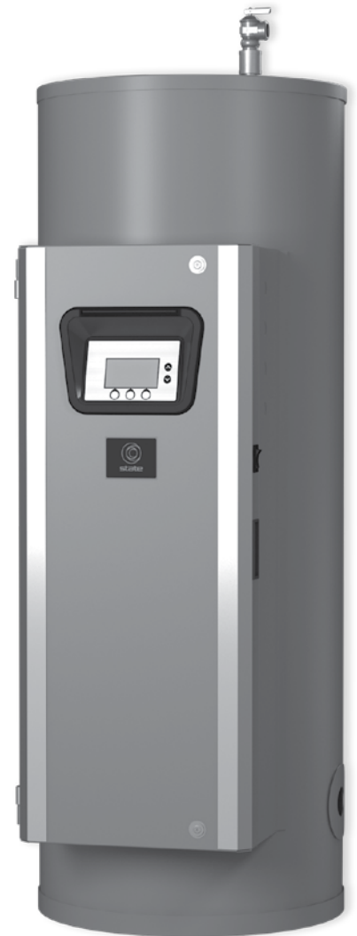
MODELS SSE 5-120 (SSE 100 SHOWN)

Attention: Changes have been made to some models. Please note that this spec sheet refers specifically to models manufactured in McBee, SC