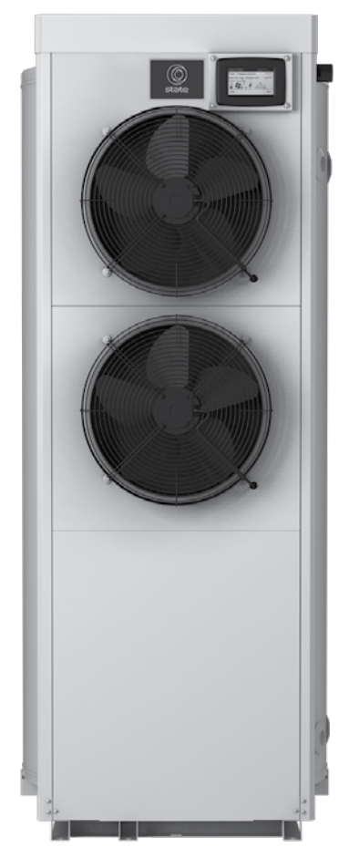
MODEL CSHP 120